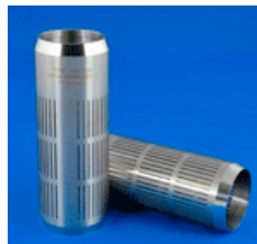
Investment Cast Stellite 6