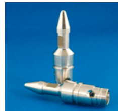
Wrought Stellite 6B